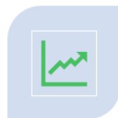
ECONOMIC ANALYSIS EMSI BURNING GLASS