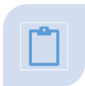
COMMUNITY SURVEY ETC INSTITUTE

The County's engagement process involved four different efforts, which are outlined in the image and sections below.