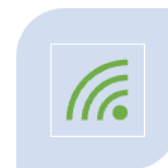
DIGITAL INCLUSION ANALYSIS GUIDEHOUSE & PUBLIC PARTICIPATION PARTNERS