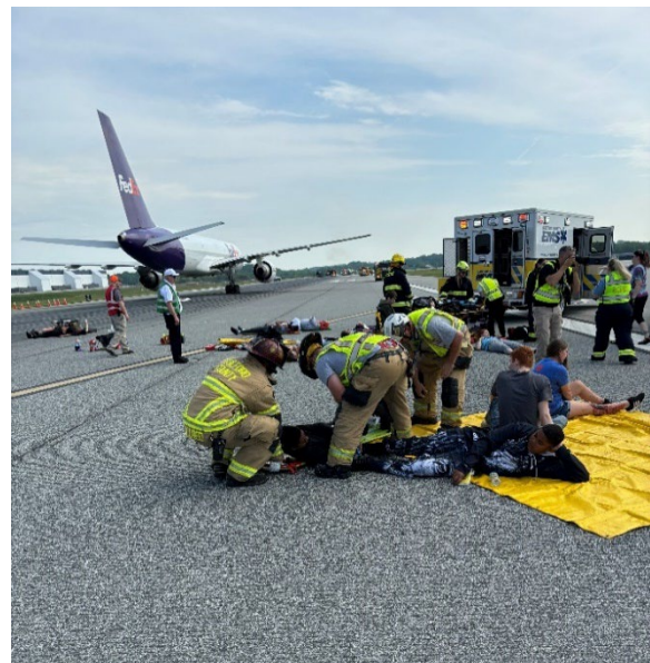
Full scale exercise at PTIA – April 20, 2024