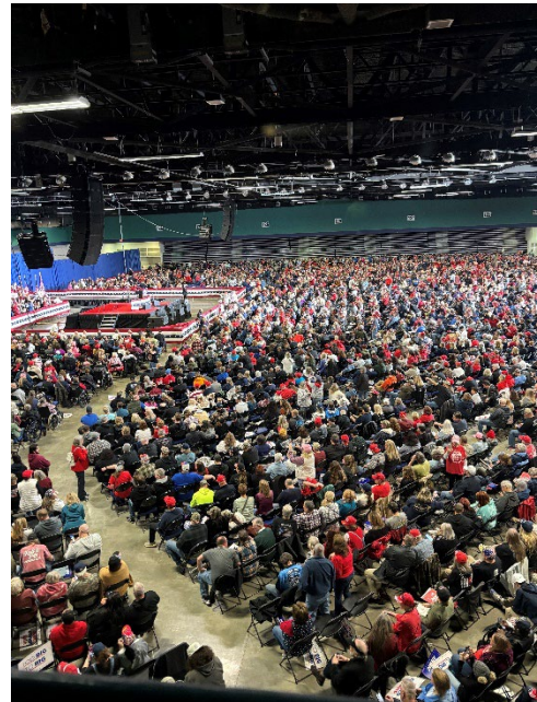
Presidential Candidate Rally – March 2, 2024

With 2024 being a presidential election year, Guilford County experienced multiple candidate visits. One event was a presidential rally at the Greensboro Coliseum on March 2, 2024. Guilford County Emergency Management along with Guilford County EMS, Greensboro Fire Department, and Greensboro Police Department provided emergency services during the rally. In coordination with the United States Secret Service, over 6,500 event goers were provided security, fire protection, and medical services. During the event, EMS treated multiple patients for various emergent medical conditions. The coordination of all agencies proved valuable in providing excellent emergency services to the attendees.