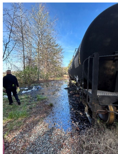
Tar spill from railcar – March 25, 2024

According to current data, Guilford County has 14 Risk Management Program (RMP) facilities, 232 Tier II facilities with Extremely Hazardous Substance (EHS) chemicals, 31 Toxic Release Inventory (TRI) facilities with EHS chemicals, and 547 facilities with Tier II submissions. This was an increase of 27 facilities from the previous year. There are 67 facilities identified as Small Hazardous Waste Generators and 59 facilities identified as Large Hazardous Waste Generators in the county.