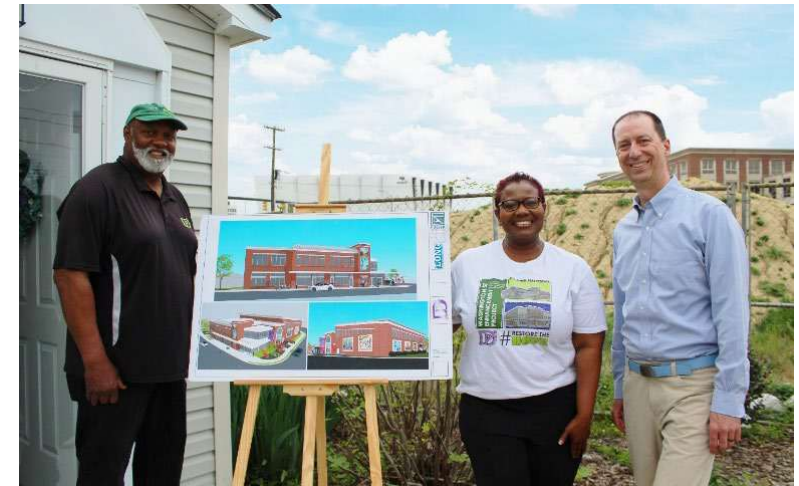
Washington Street Final Plans