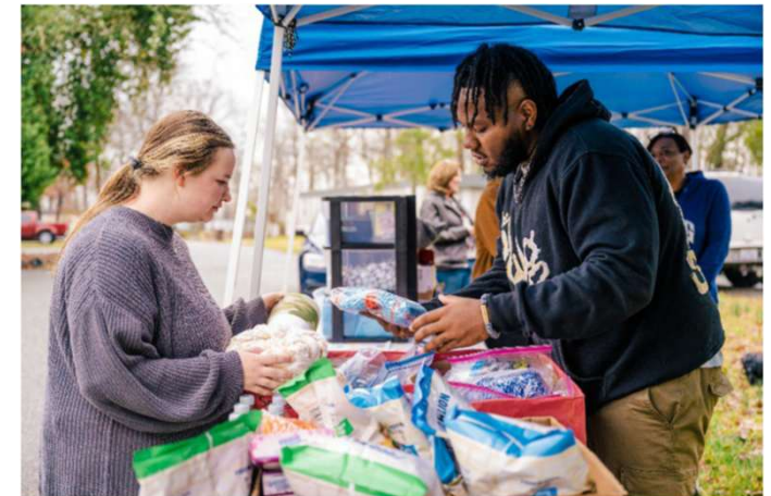
Food giveaway at a GCSTOP Community Supply Distribution Event