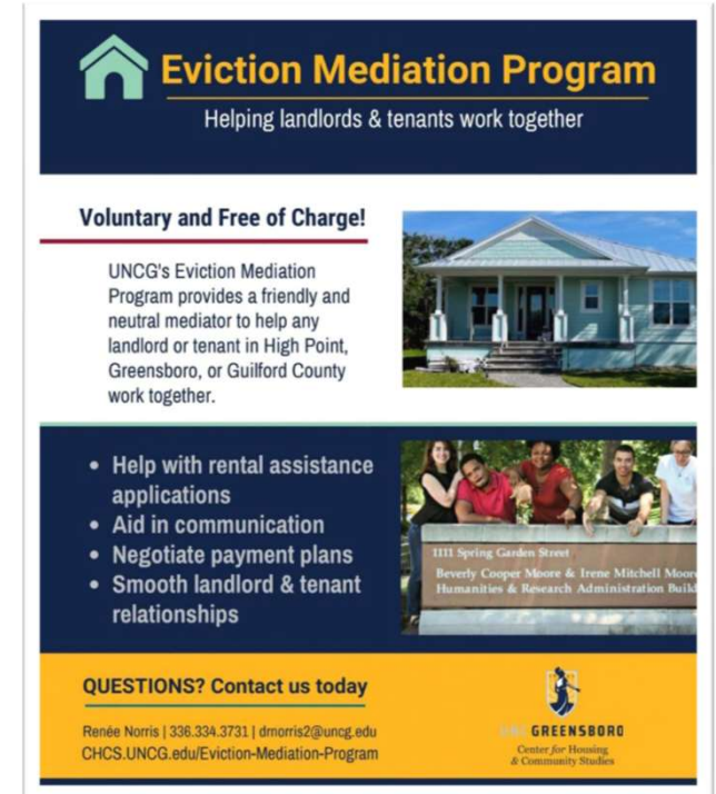
Eviction Mediation clinic handout