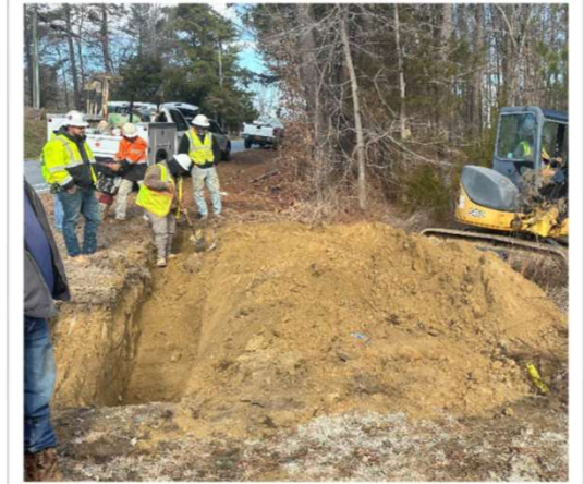
Pinecroft Sedgefield Fire District installing fire hydrants