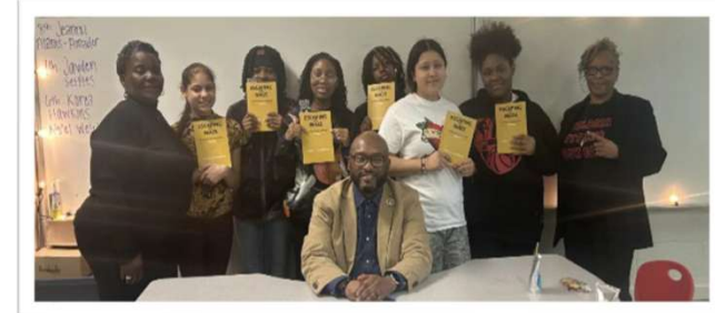
Welborn, a weekly book club part of Tomorrow's Titans Program, fosters literacy.