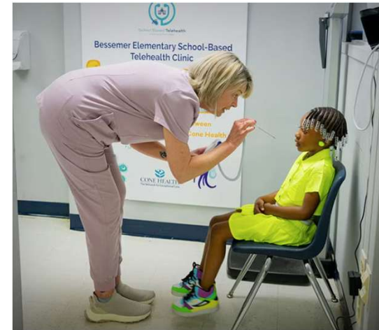
Certified medical assistant at Bessmer Elementary