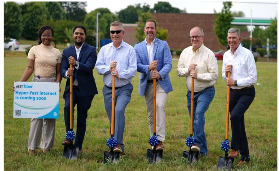
AT&T Broadband Expansion Groundbreaking Event

73,000 Households or individuals directly benefited from ARPA funded programs to date